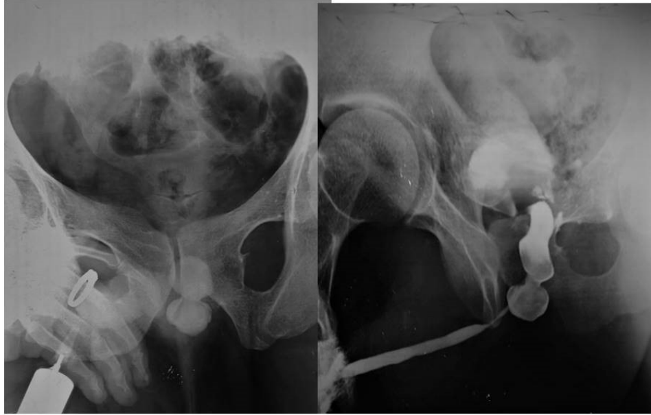
Figure 1. Xray Pelvis a. Plain xray show dumbbell shaped calculus in pelvis b. retrograde urethrogram show contrast going into urinary bladder