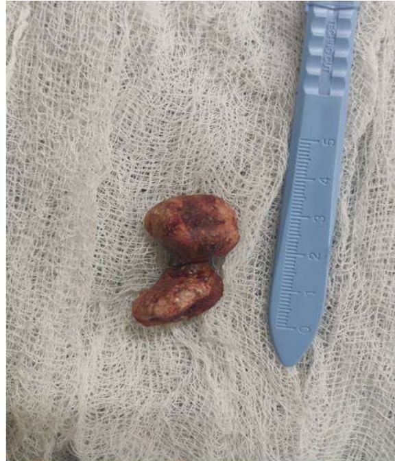
Figure 3. Postoperative picture show dumbbell shaped calculus 3.5 x 1.5 cm