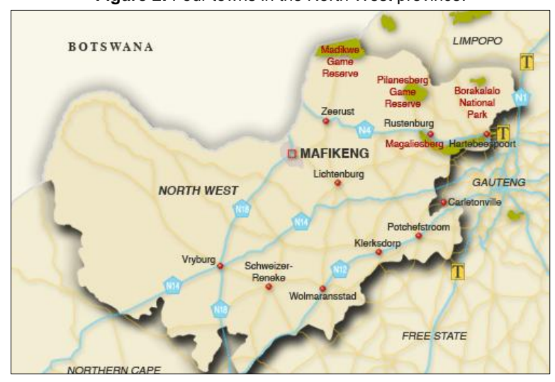
Figure 2: Four towns in the North West province.

Data analysis began with a search for specific words expressed by participants. Using a summative analysis to count and contextualize them, the researcher transcribed the interviews from recorded to textual data, read and reread the transcripts to take notes while reading, and then uploaded them to Atlas.ti. Atlas.ti was used to do the search, which appears to be critical to understanding the phenomenon in focus. Using Atlas.ti, the researcher named the initial codes through the transcripts and listed the codes [11]. The researcher listed the code categories and classified the codes into themes. The researcher also generated codes into themes and addressed credibility through prolonged engagement and debriefing to ensure the trustworthiness of qualitative research.