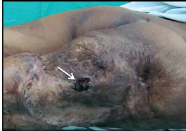
Figure 2: Reported case of Marjolin's ulcer in lower limb due to previous burn scar [11]